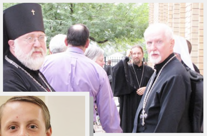
Archbishop Benjamin, clergy, and lay delegates enjoy the mild Arizona weather before heading over to dinner (above).