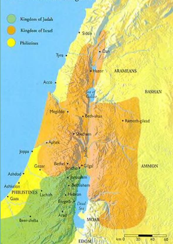
Map 25 The division of the Kingdom

This weekly bulletin insert complements the curriculum published by the Department of Christian Education of the Orthodox Church in America. This and many other Christian Education resources are avail-