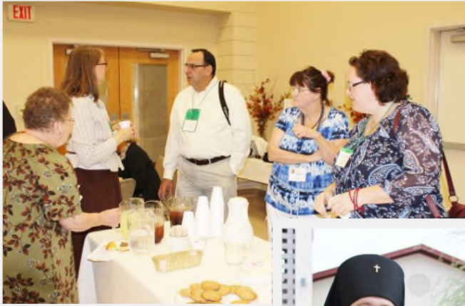
A buffet of appetizers and pastries awaits guests (above). Archbishop Benjamin and Metropolitan Tikhon arrive at