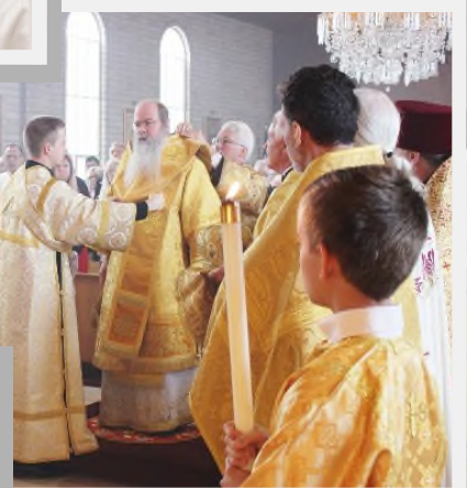
Divine Liturgy begins with the vesting of Metropolitan Tikhon (above). Archbishop Benjamin during the Great Entrance (below)