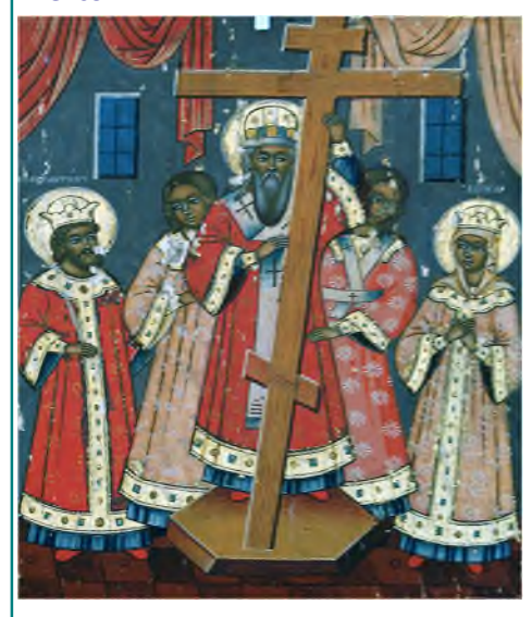
19th century Russian icon

In the center of the icon we can see St Macarius, on the pulpit, holding the True Cross of Christ 'with fear and trembling'. ** On the right, and at a lower level, there is the Empress Saint Helen facing the Cross and motioning in petition. A smaller or larger group of clergy and lay people is also shown, depending on the icon. They are all attending the magnificent event. In some variations of the icon, on the left